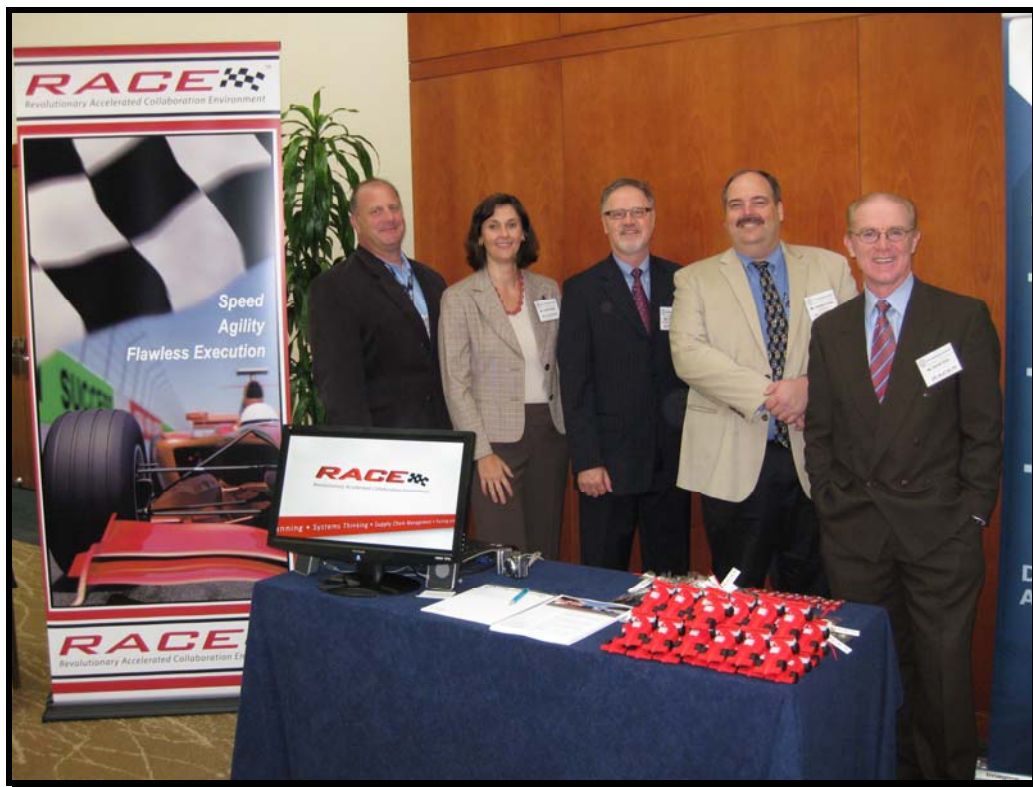
The RACE team were very evident during the DoD conference

RACE is a collaborative partnership of performance improvement leaders from industry and government, strategically integrated into a single, cohesive, high-performance team offering a depth and breadth of experience, knowledge and capability unmatched by any single organization. The foundation of RACE is Derek's "Winners Model" of Speed, Agility & Flawless Execution .